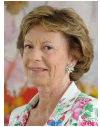
Neelie Kroes

It's not clear what SPARC stands for in a robotics context. The EU has already used it for different projects on Scholarly Publishing and Academic Resources Coalition, Space Awareness for Critical Infrastructure, Spatial Planning and Regional Competitiveness, and perhaps other projects.