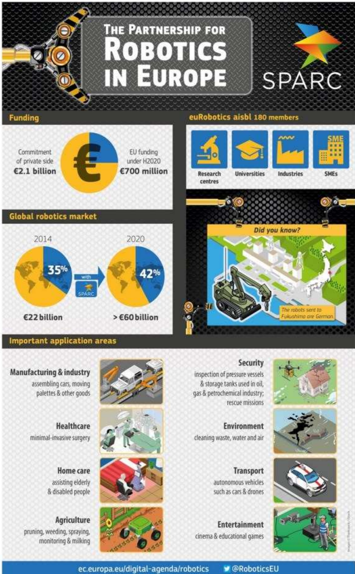
Infographic from euRobotics