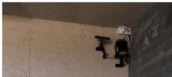
Picture 4: Detail of the Pentalo 3D cameras and KIO beacons for motion capture